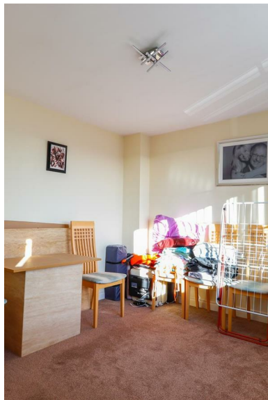
Afal Sur, Barry, CF63 1FX