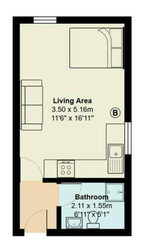
Total Area: 24.0 m^2 \hdots 259 ft^2 All measurements are approximate and for display purposes only