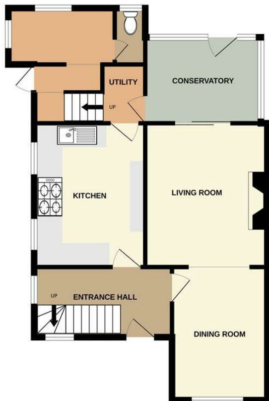
GROUND FLOOR 639 sq.ft. (59.4 sq.m.) approx.