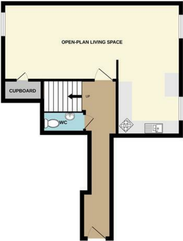
1ST FLOOR 409 sq.ft. (38.0 sq.m.) approx.