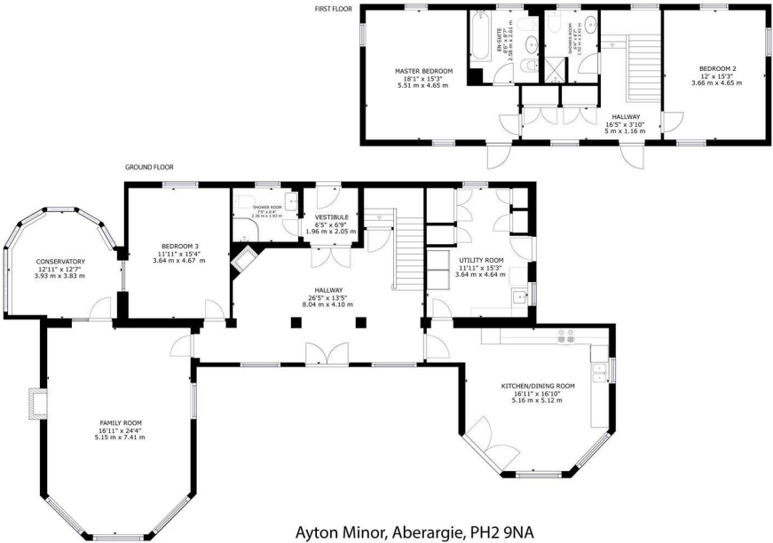
Ayton Minor, Aberargie, PH2 9NA

GROSS INTERNAL AREA FLOOR 1: 1729 sq ft, 160.59 m 2 ; FLOOR 2: 719 sq ft, 66.78 m 2 TOTAL: 2448 sq ft, 227.37 m 2 SIZES AND DIMENSIONS ARE APPROXIMATE. ACTUAL MAY VARY.