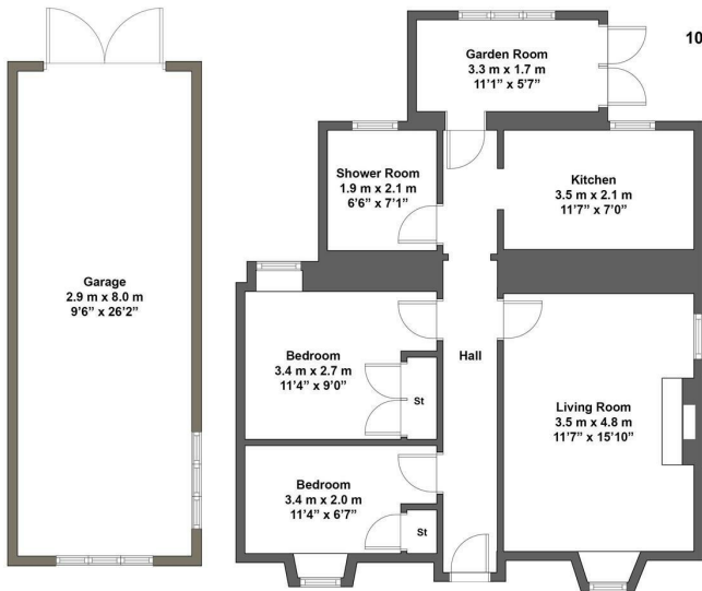
10 Inchyra Village, Glencarse PH2 7LT Plan not to scale. For illustrative purposes only.