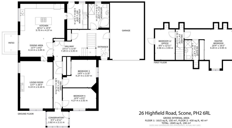
26 Highfield Road, Scone, PH2 6RL

GROSS INTERNAL AREA FLOOR 1: 1615 sq.ft, 150 m 2 , FLOOR 2: 430 sq.ft, 40 m 2 TOTAL: 2045 sq.ft, 190 m 2