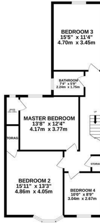
1ST FLOOR 846 sq.ft. (78.6 sq.m.) approx.