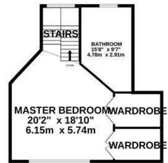
1ST FLOOR 631 sq.ft. (58.6 sq.m.) approx.