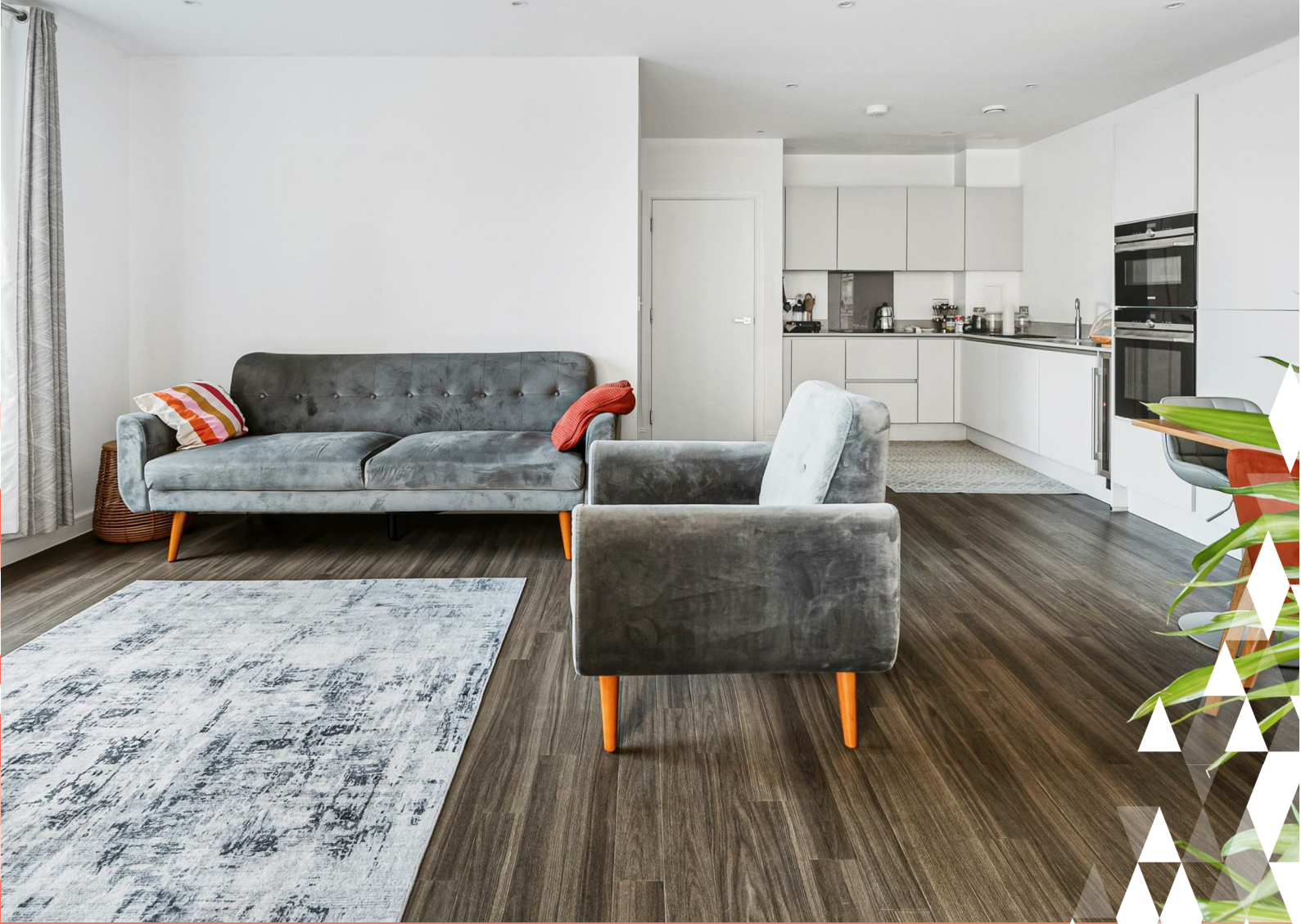
Munster Court Approximate Gross Internal Area = 85.7 sq m / 922 sq ft