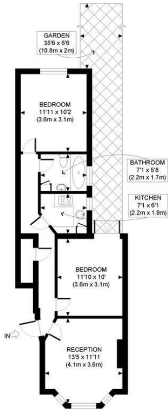
GROUND FLOOR GROSS INTERNAL FLOOR AREA 574 SQ FT

APPROX. GROSS INTERNAL FLOOR AREA: 574 SQ FT/ 53 SQM