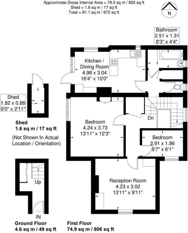
Goldsmith House Approximate Gross Internal Area = 79.5 sq m / 855 sq ft Shed = 1.6 sq m / 17 sq ft Total = 81.1 sq m / 872 sq ft

Although every attempt has been made to ensure accuracy, all measurements are approximate. The floorplan is for illustrative purposes only and not to scale.