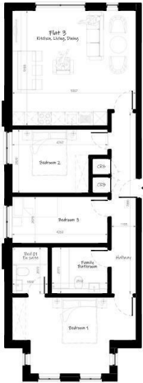
FLAT 3 - (3 Bed Apartment)

Dimensions Total Gross Internal area *Includes internal walls