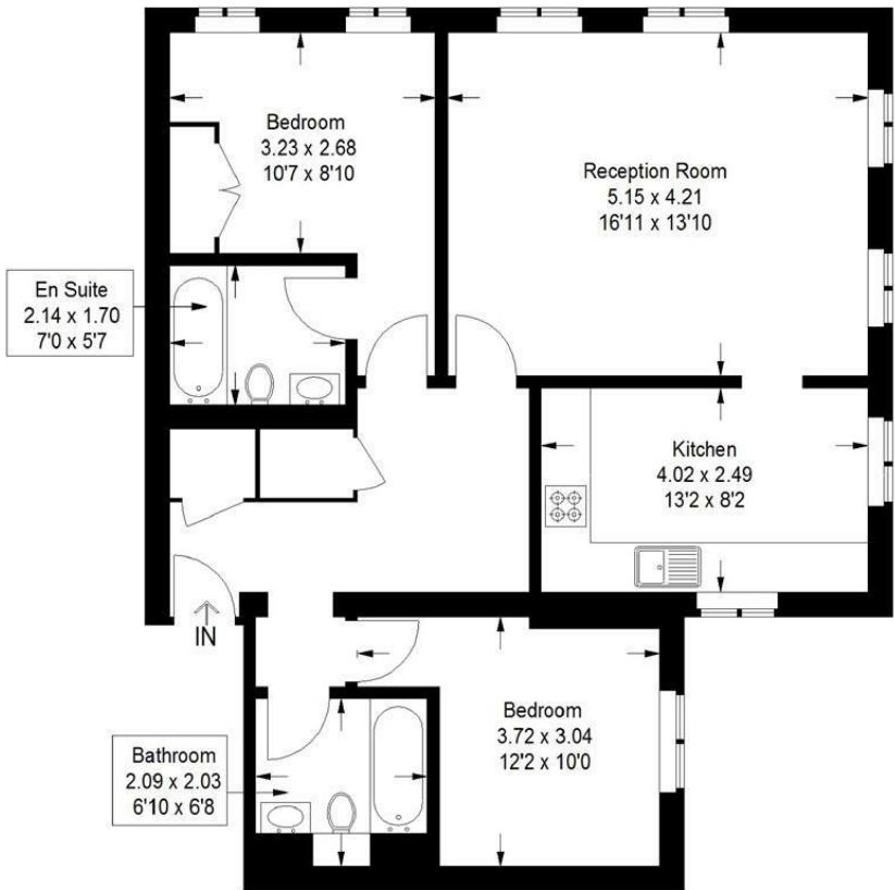
Third Floor 75.4 sq m / 812 sq ft

Approximate Gross Internal Area 75.4 sq m / 812 sq ft