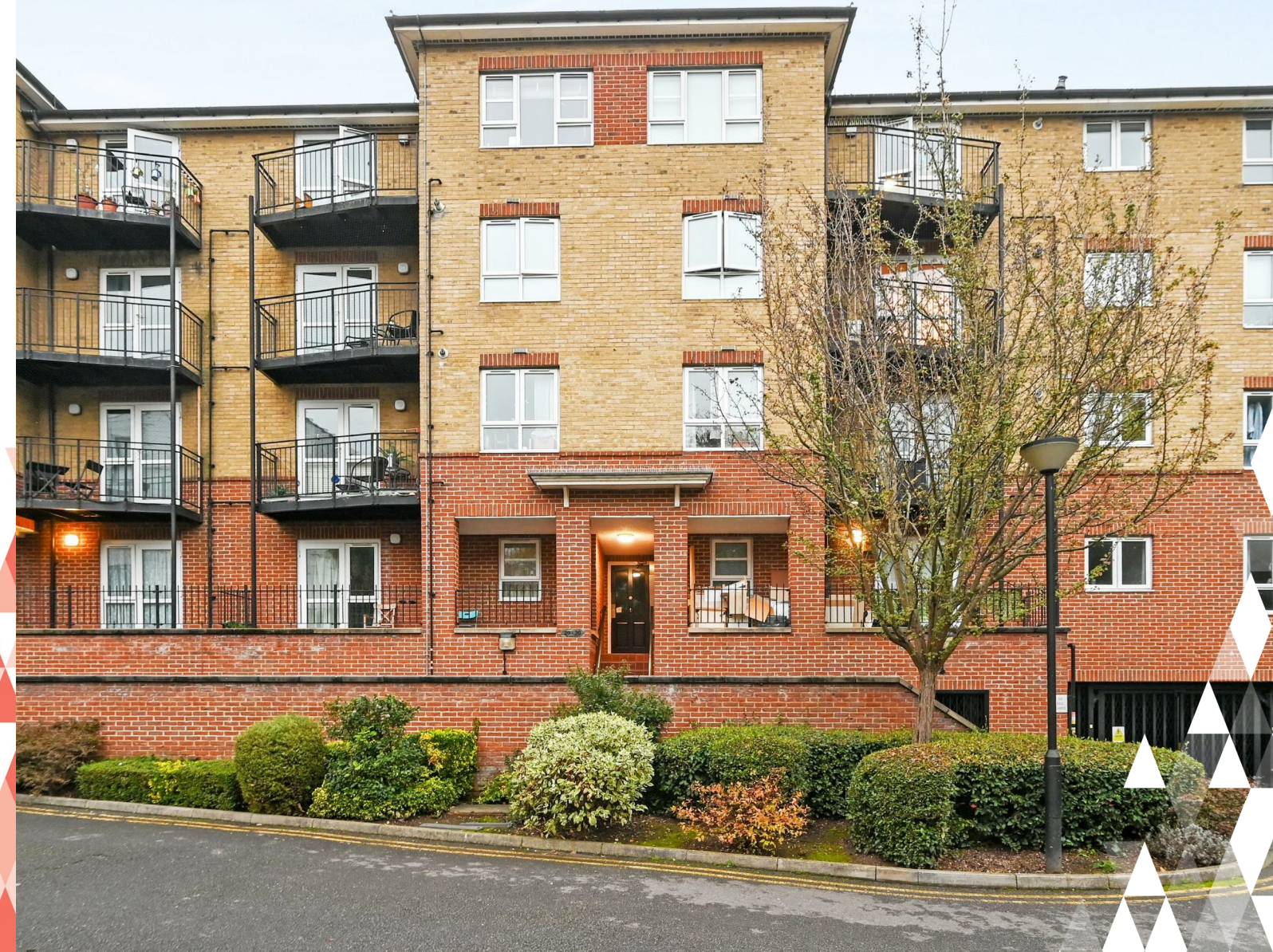
Greenview Close Approximate Gross Internal Area 75.4 sq m / 812 sq ft