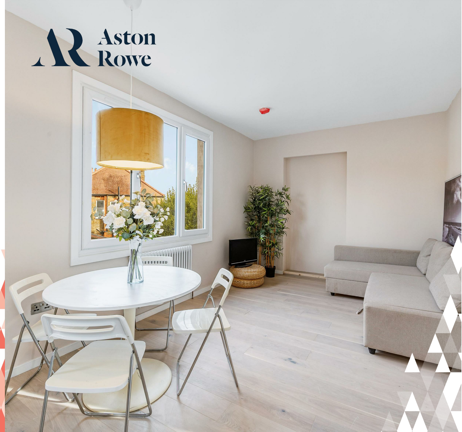
Cumberland Park Approximate Gross Internal Area = 39.2 sq m / 421 sq ft