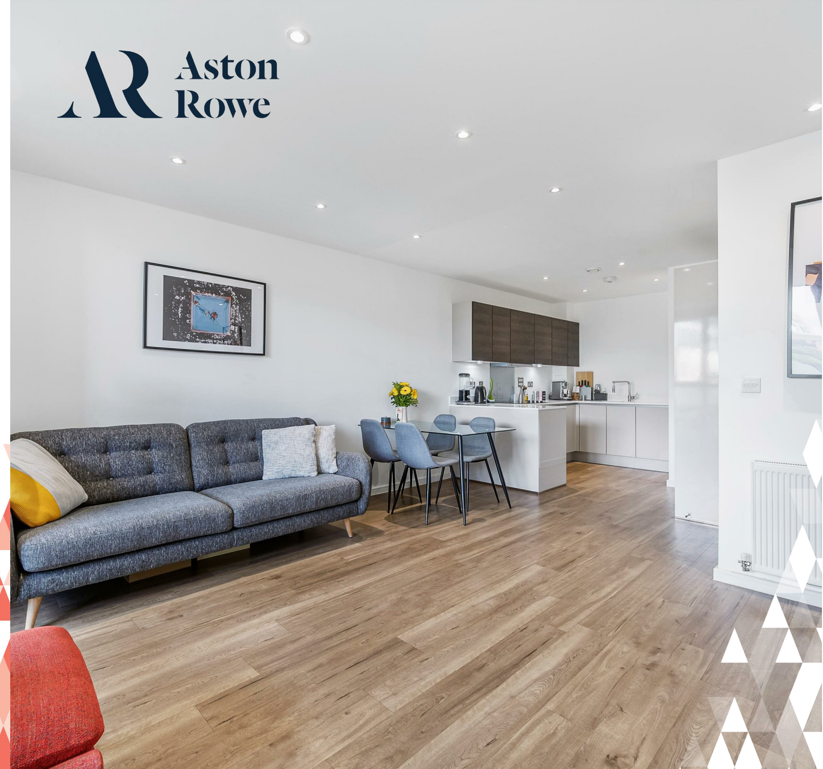
Elmond Mansions Approximate Gross Internal Area = 78.3 sq m / 842 sq ft