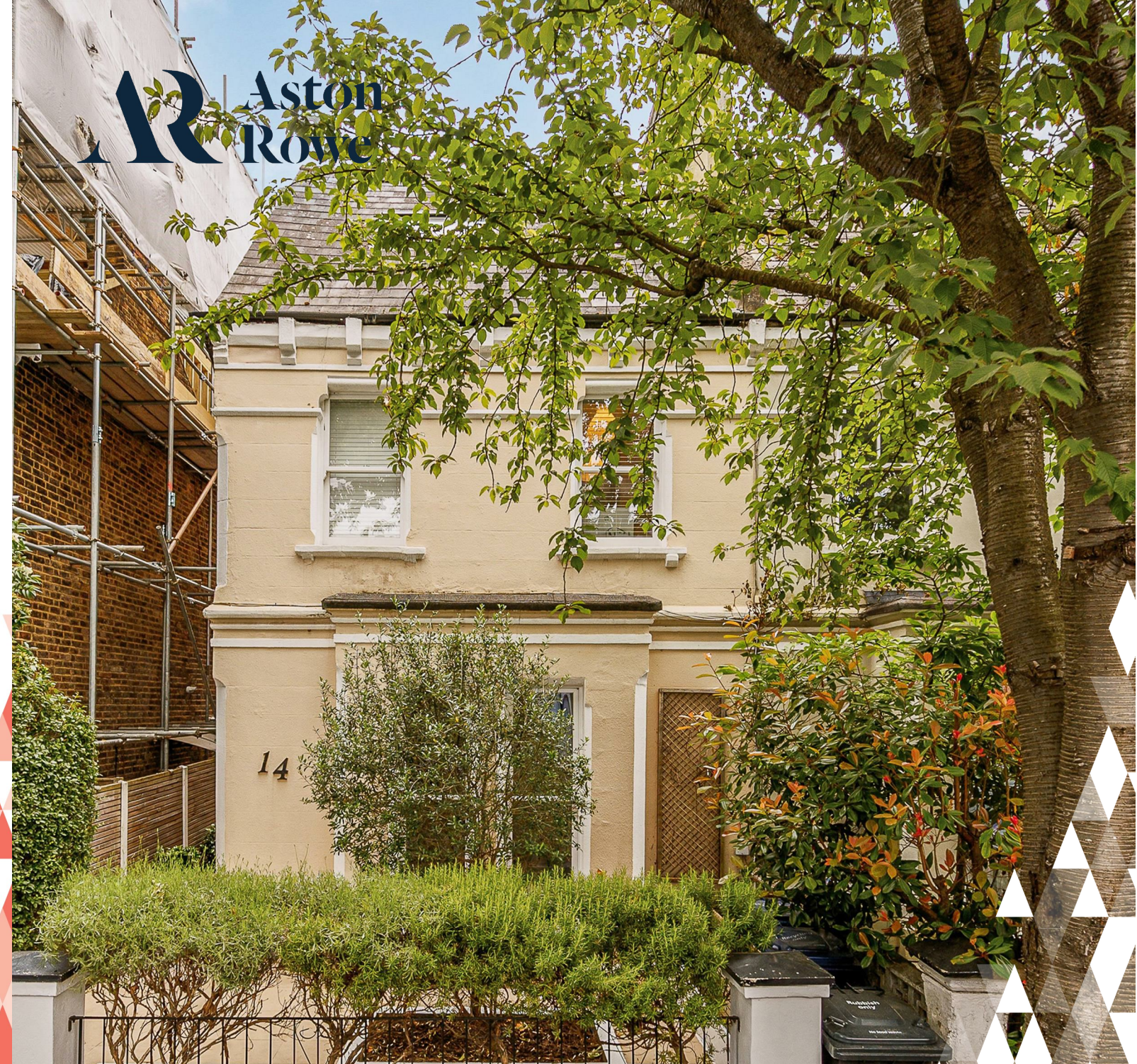
Mansell Road Approximate Gross Internal Area = 65.1 sq m / 700 sq ft