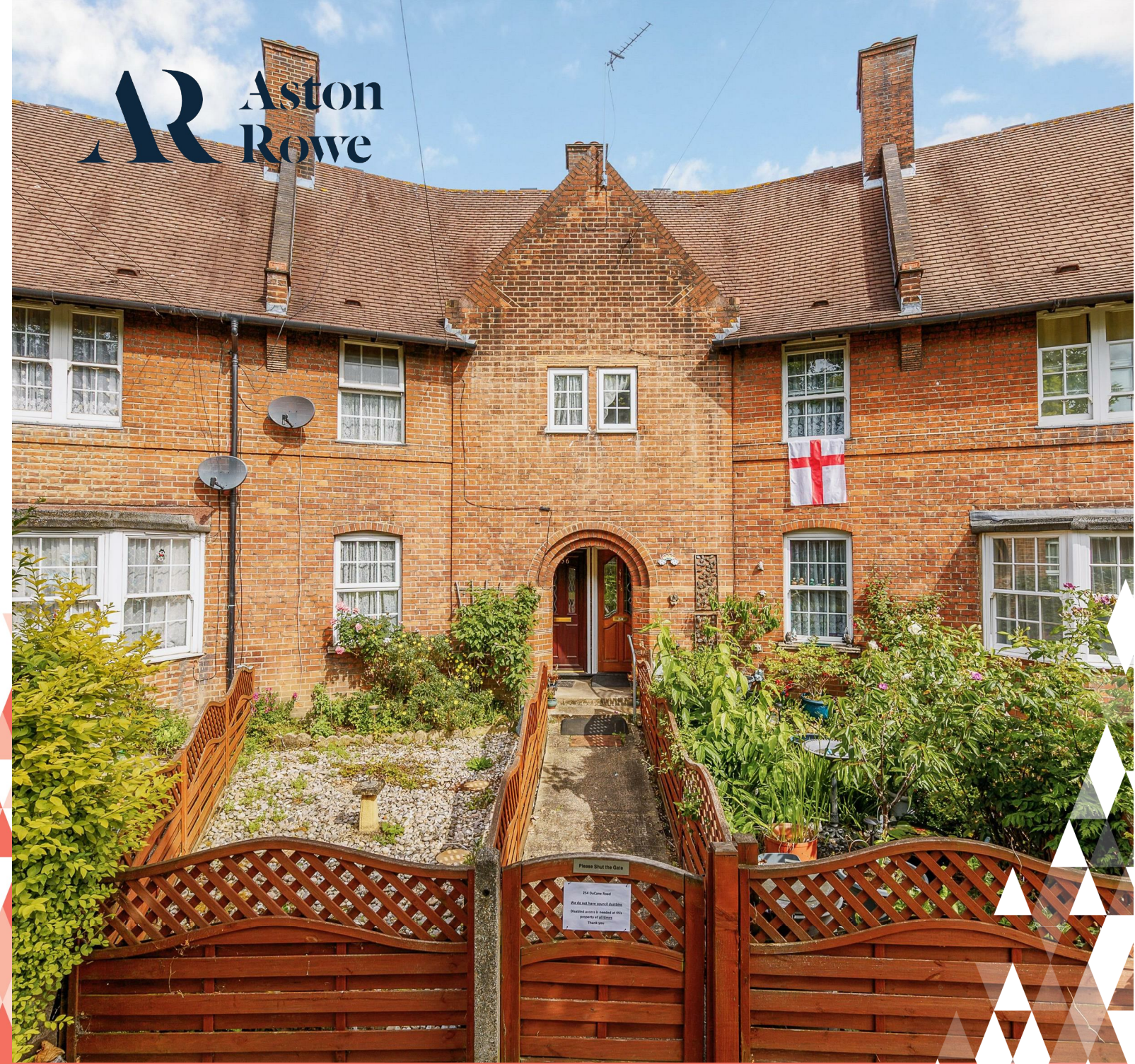
Ducane Road Approximate Gross Internal Area = 82.5 sq m / 888 sq ft