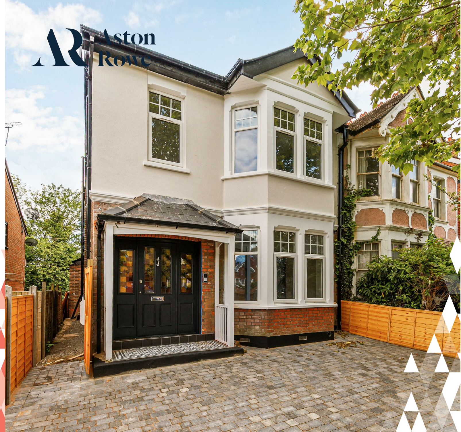
Lynton Road Approximate Gross Internal Area = 49.2 sq m / 529 sq ft