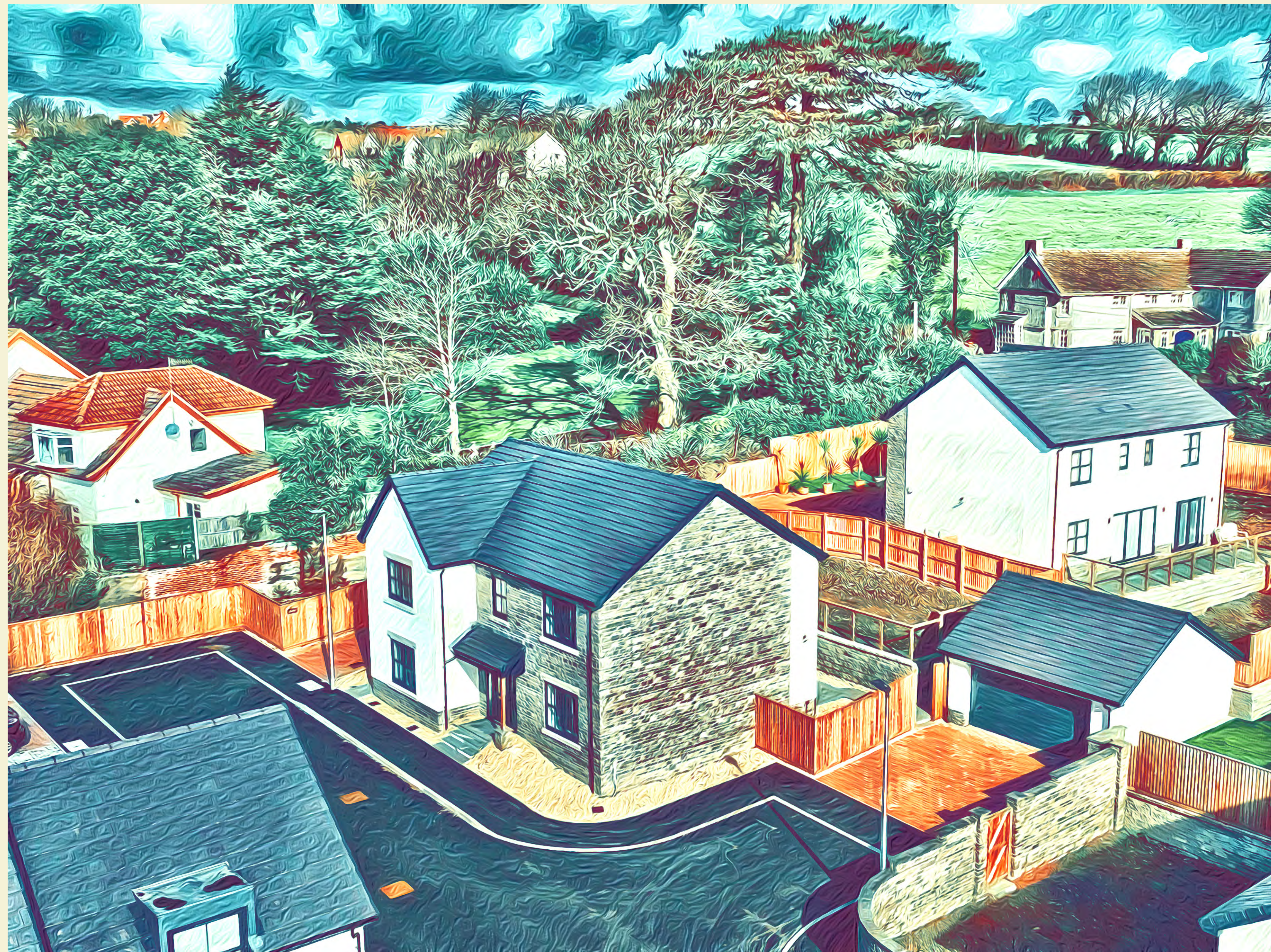
Plot 10 Pen-Y-Fai Gardens, Pen Y Fai Lane, Llanelli, SA15 4EN