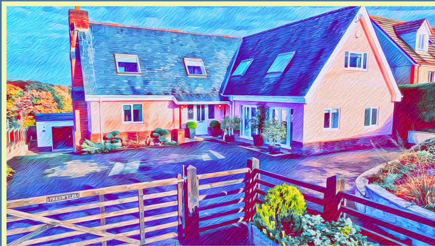
Preswylfa, Milo, Carmarthenshire, SA18 3NX