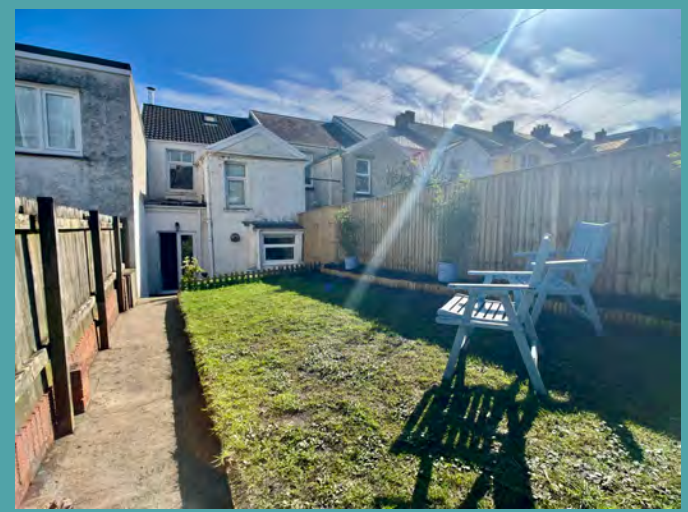
The property is FREEHOLD

The property is connected to all mains services and the central heating is gas fired