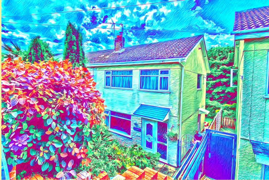
10 Pennard Drive, Pennard, Gower, SA3 2BL