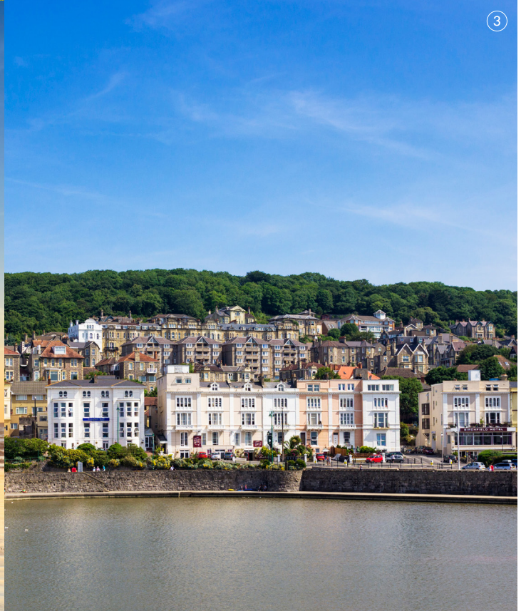
① ↳ Artists impression of The Wick ② ↳ The Pier, Weston-super-Mare ③ ↳ Weston-super-Mare Old Town, Somerset