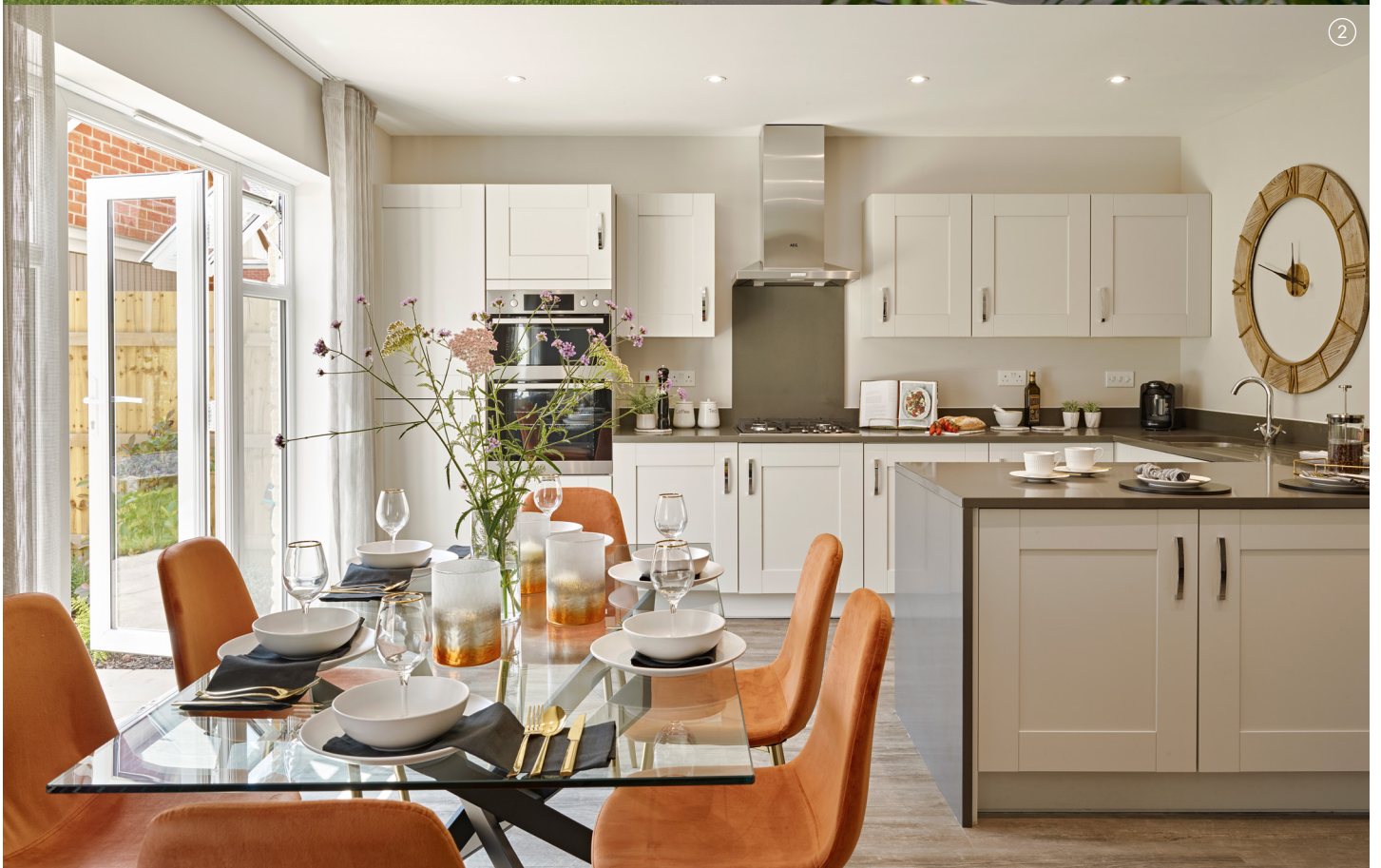
① → Street Scene at The Wick ② → Typical Interior