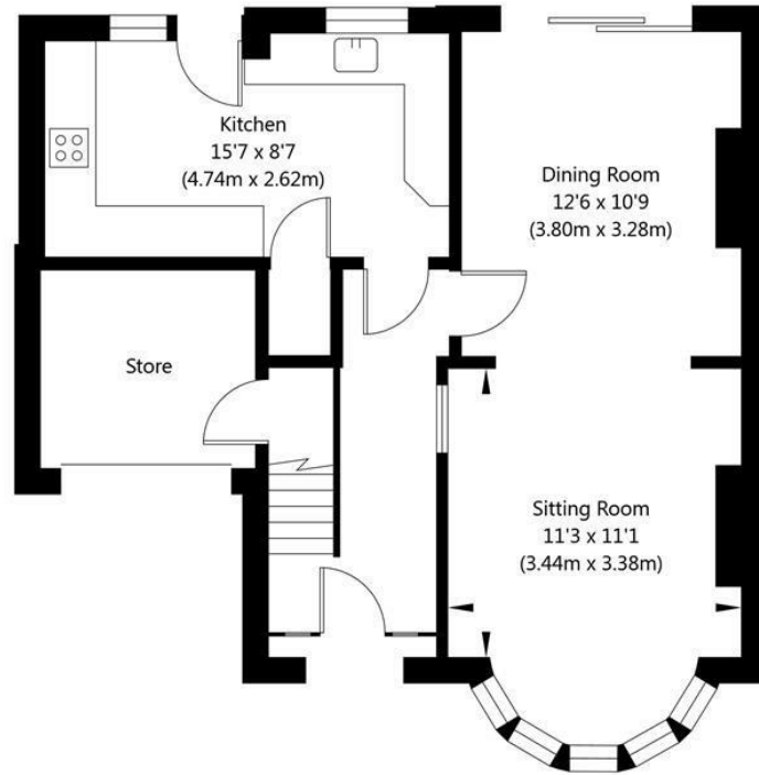
Ground Floor - (Excluding Store) GROSS INTERNAL FLOOR AREA APPROX. 522 SQ FT / 48.49 SQ M