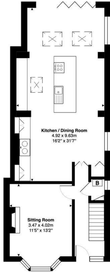
Ground Floor Gross Internal Area: 68.8 m 2 ... 741 ft 2

Gross Internal Area: 116.4 m 2... 1253 ft 2 (excluding garage) All measurements are approximated for display purposes only and should be independently verified