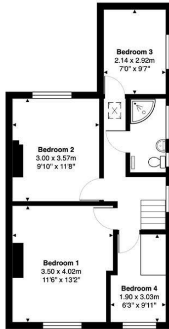
First Floor Gross Internal Area: 47.5 m 2 ... 511 ft 2

Gross Internal Area: 116.4 m 2... 1253 ft 2 (excluding garage) All measurements are approximated for display purposes only and should be independently verified