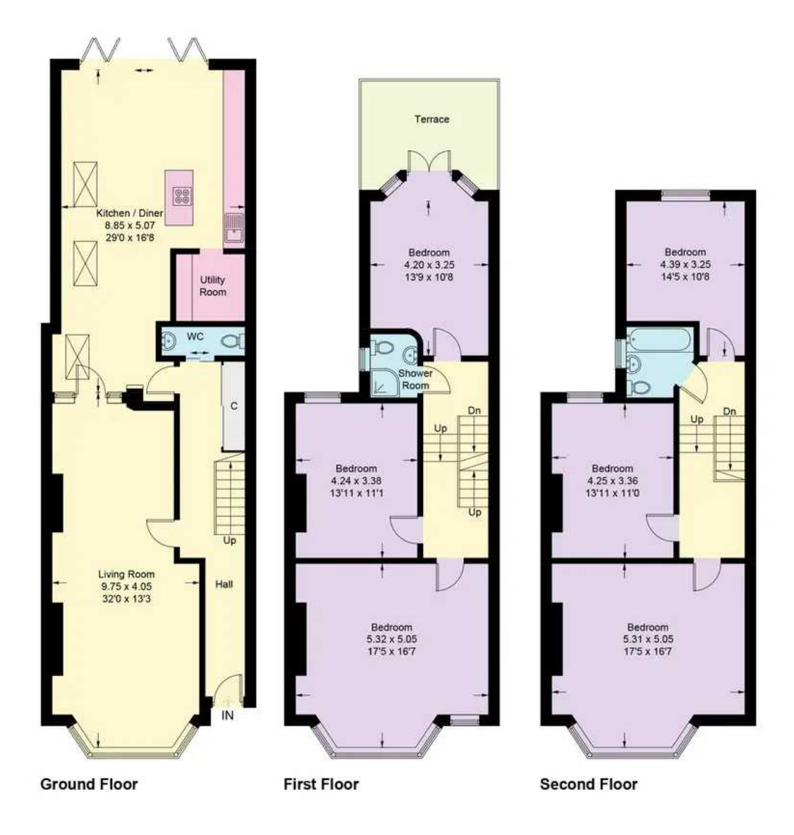
Approximate Gross Internal Area 227.4 sq m / 2447 sq ft

This plan is for layout guidance only. Not drawn to scale unless stated. Windows and door openings are approximate. Whilst every care is taken in the preparation of this plan, please check all dimensions, shapes and compass bearings before making any decisions reliant upon them. (ID1032676)