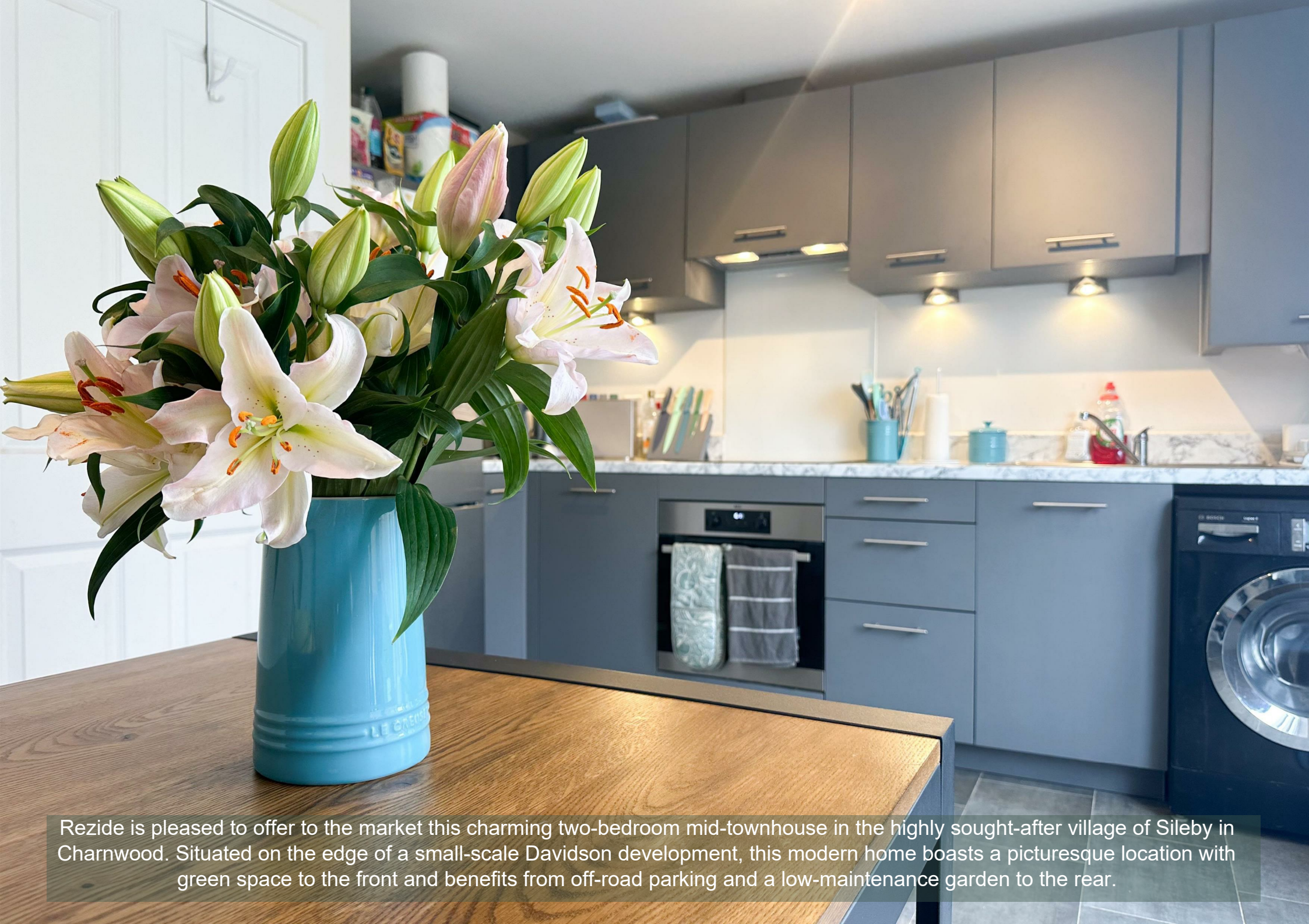
Rezide is pleased to offer to the market this charming two-bedroom mid-townhouse in the highly sought-after village of Sileby in Charnwood. Situated on the edge of a small-scale Davidson development, this modern home boasts a picturesque location with green space to the front and benefits from off-road parking and a low-maintenance garden to the rear.