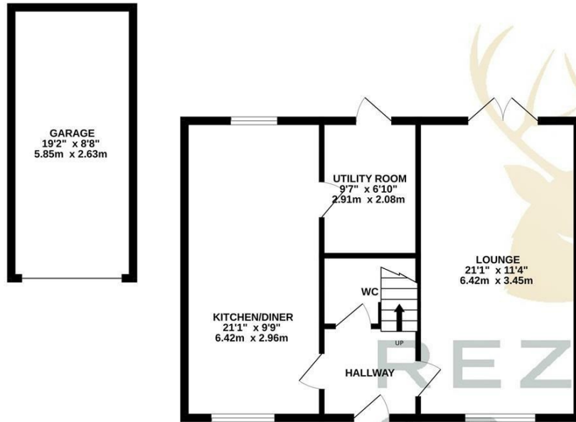
GROUND FLOOR 752 sq.ft. (69.9 sq.m.) approx.