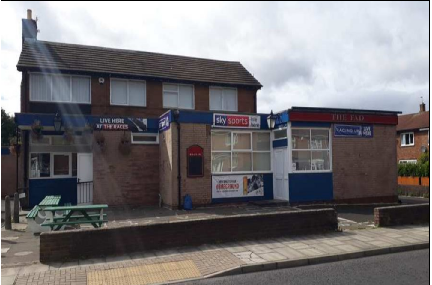
The Fad, Gainsborough Avenue, South Shields, , NE34 8JN

New Lease Available - Rental Offers Invited