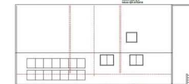
Roof plan 1:100

The building is designed to be a residential dwelling. The architect will be responsible for the design and construction of the building and will be responsible for the design and construction of the building and will be responsible for the design and construction of the building.