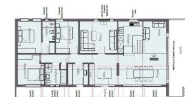
Ground floor plan 1:100