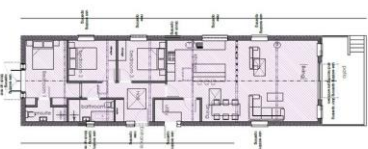
Ground floor plan: 1:100