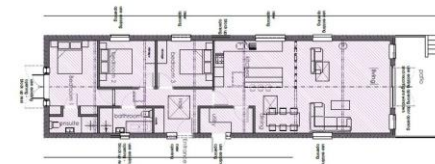
Ground floor plan 1:100