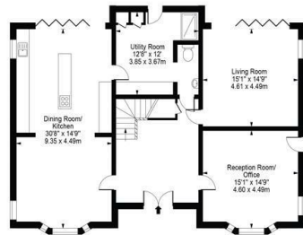
For Illustration Purposes Only - Not To Scale

This floor plan should be used as a general outline for guidance only and does not constitute in whole or in part an offer or contract. Any intending purchaser or lessee should satisfy themselves by inspection, searches, enquiries and full survey as to the correctness of each statement. Any areas, measurements or distances quoted are approximate and should not be used to value a property or be the basis of any sale or let.