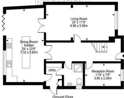
Ground Floor For Illustration Purposes Only - Not To Scale

This floor plan should be used as a general outline for guidance only and does not constitute in whole or in part an offer or contract. Any intending purchaser or lessee should satisfy themselves by inspection, searches, enquiries and full survey as to the correctness of each statement. Any areas, measurements or distances quoted are approximate and should not be used to value a property or be the basis of any sale or let.