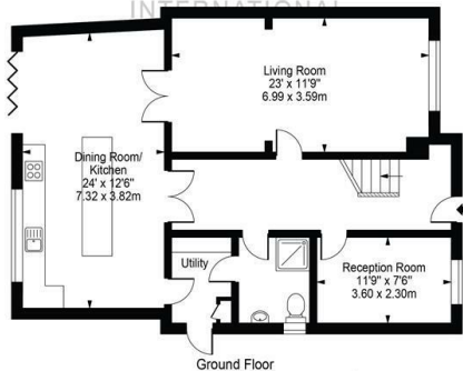
Ground Floor For Illustration Purposes Only - Not To Scale

This floor plan should be used as a general outline for guidance only and does not constitute in whole or in part an offer or contract. Any intending purchaser or lessee should satisfy themselves by inspection, searches, enquiries and full survey as to the correctness of each statement. Any areas, measurements or distances quoted are approximate and should not be used to value a property or be the basis of any sale or let.