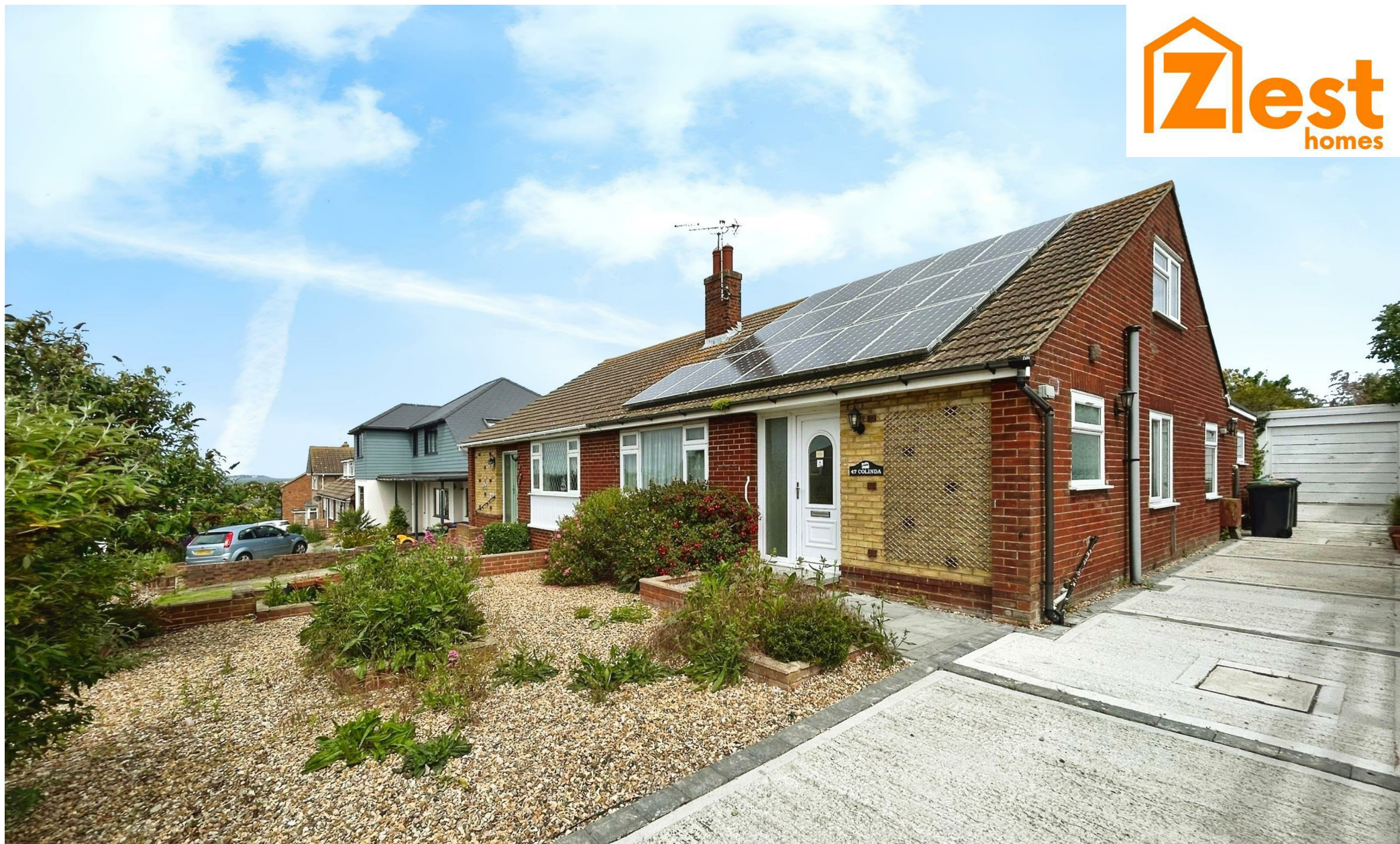
47 Downs Avenue, Whitstable, CT5 1RR £400,000