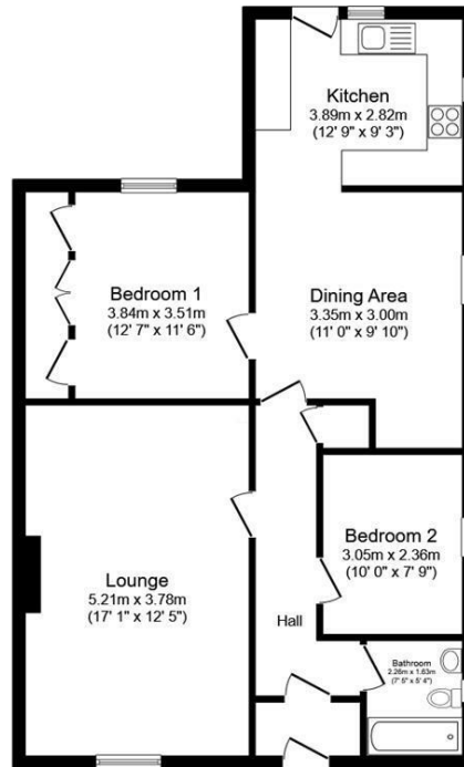
Floor Plan Floor area 80.7 sq.m. (869 sq.ft.)

Total floor area: 80.7 sq.m. (869 sq.ft.)