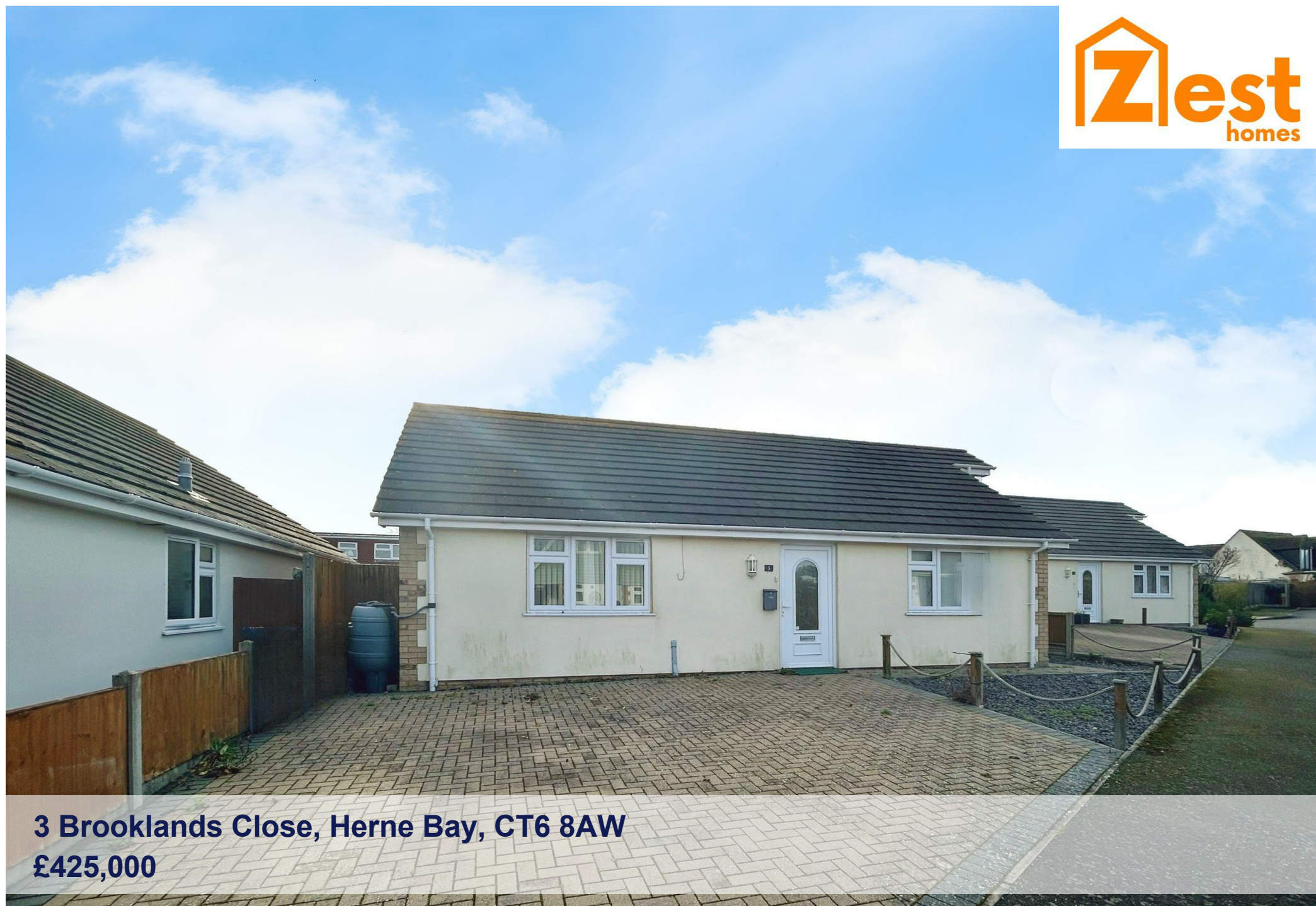
3 Brooklands Close, Herne Bay, CT6 8AW £425,000