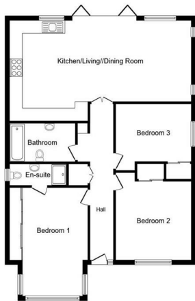
Floor Plan Floor area 99.5 m 2 (1,072 sq.ft.)