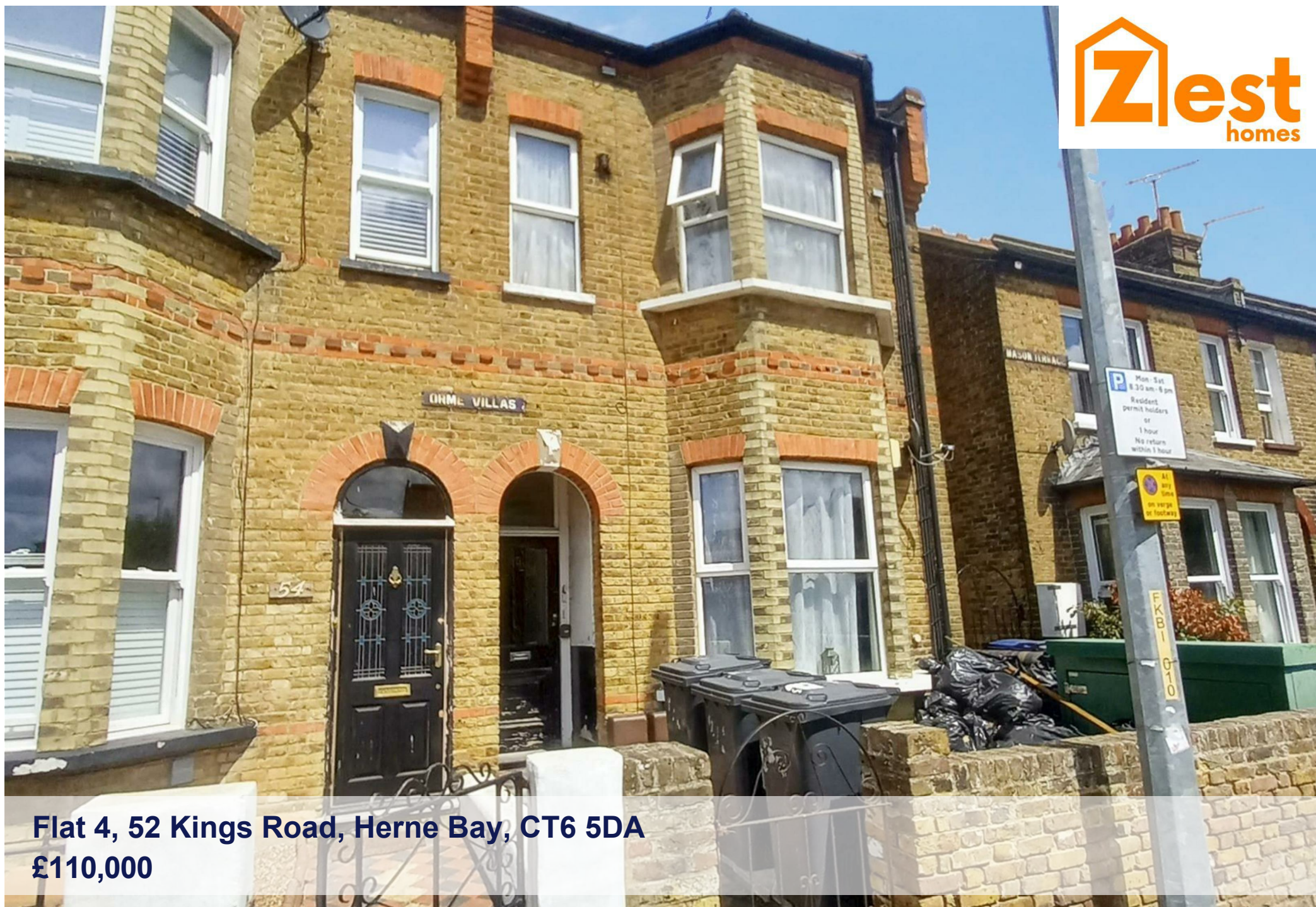
Flat 4, 52 Kings Road, Herne Bay, CT6 5DA £110,000