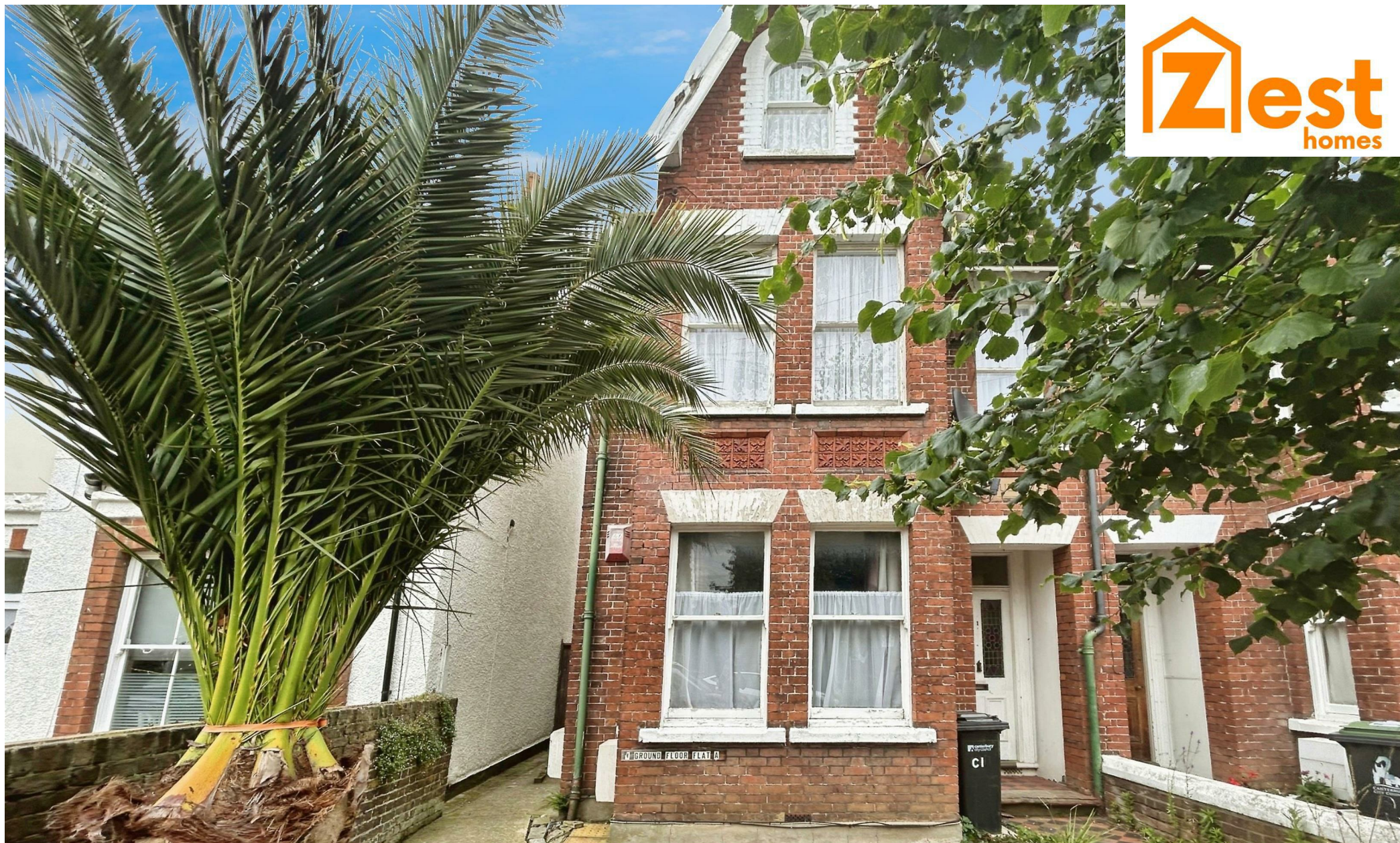
Flat A, The Cottage, 1 Queens Gardens, Herne Bay, CT6 5BS £250,000