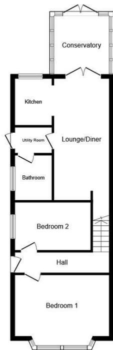
Floor Plan Floor area 66.9 m 2 (721 sq.ft.)