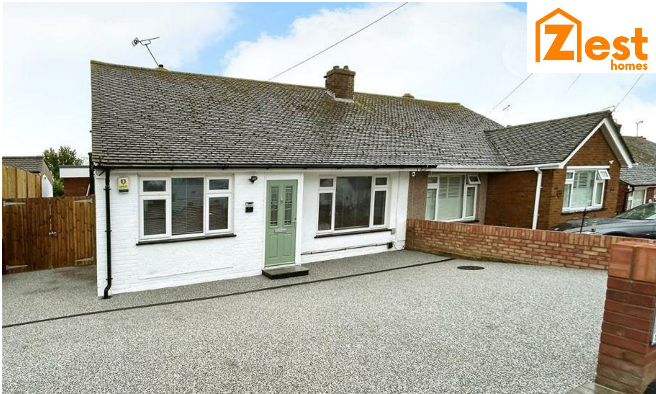
5 Crown Hill Road, Herne Bay, CT6 8DB £485,000