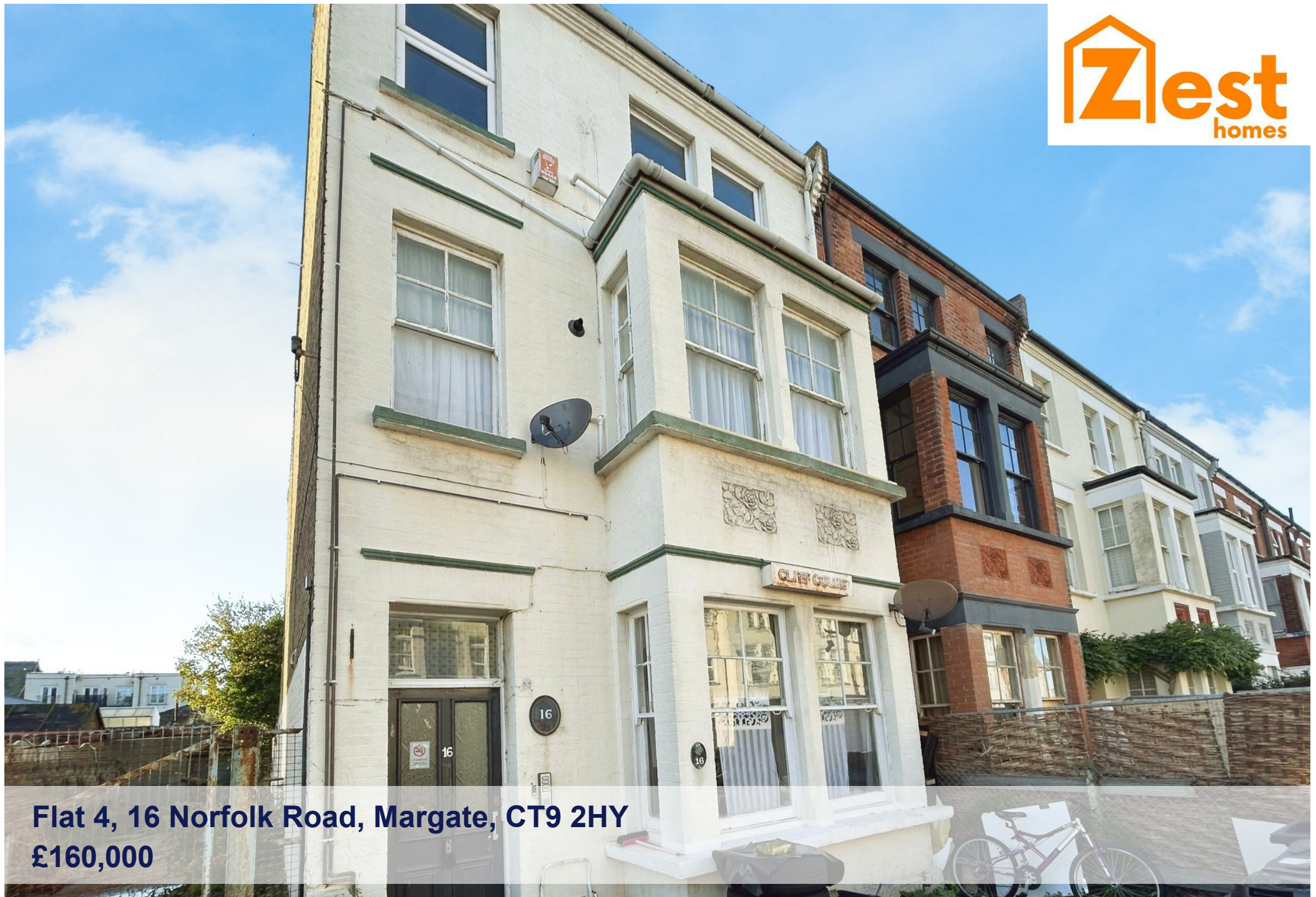
Flat 4, 16 Norfolk Road, Margate, CT9 2HY £160,000