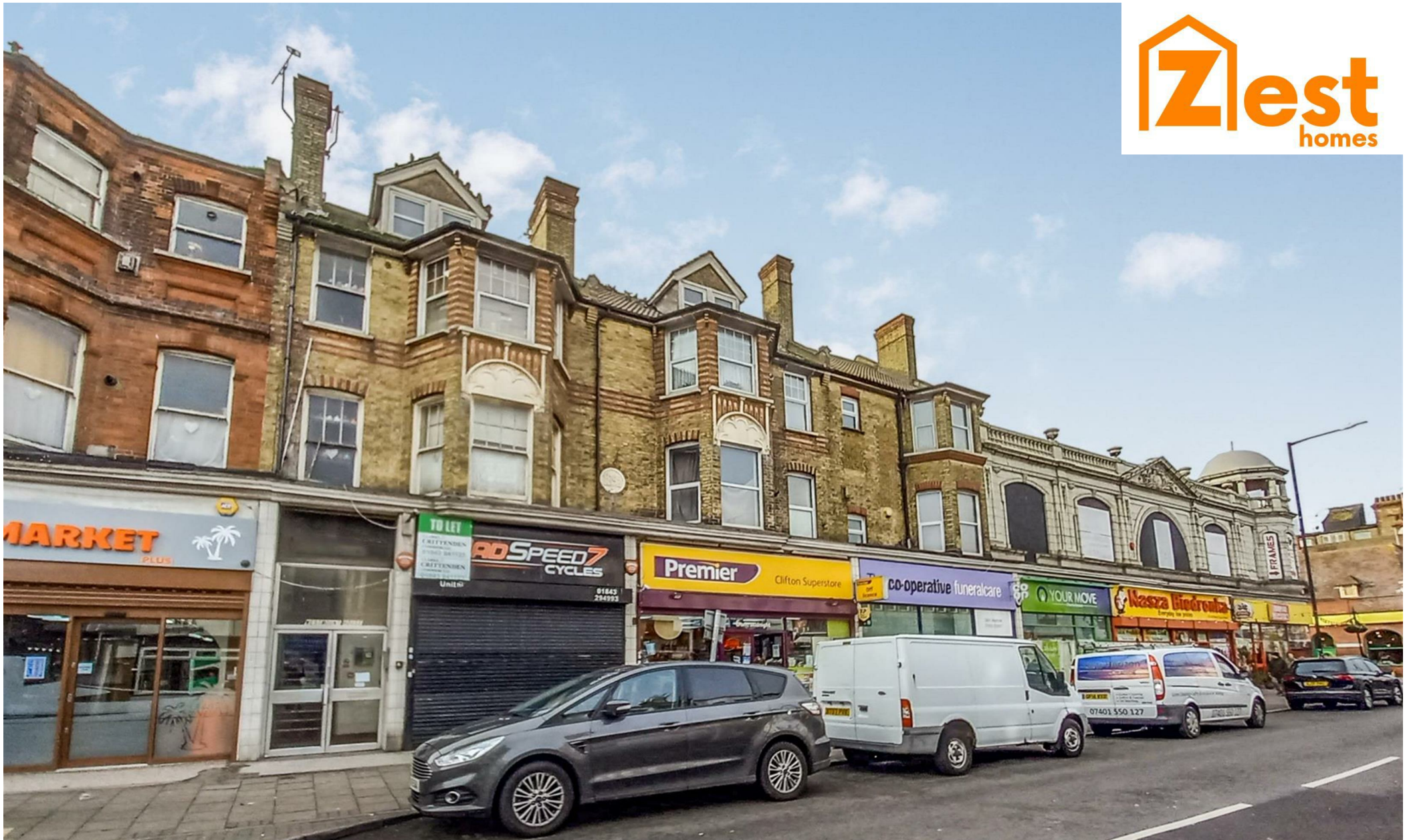
1 Westmount House 220-228 Northdown Road, Margate, CT9 2RP £165,000