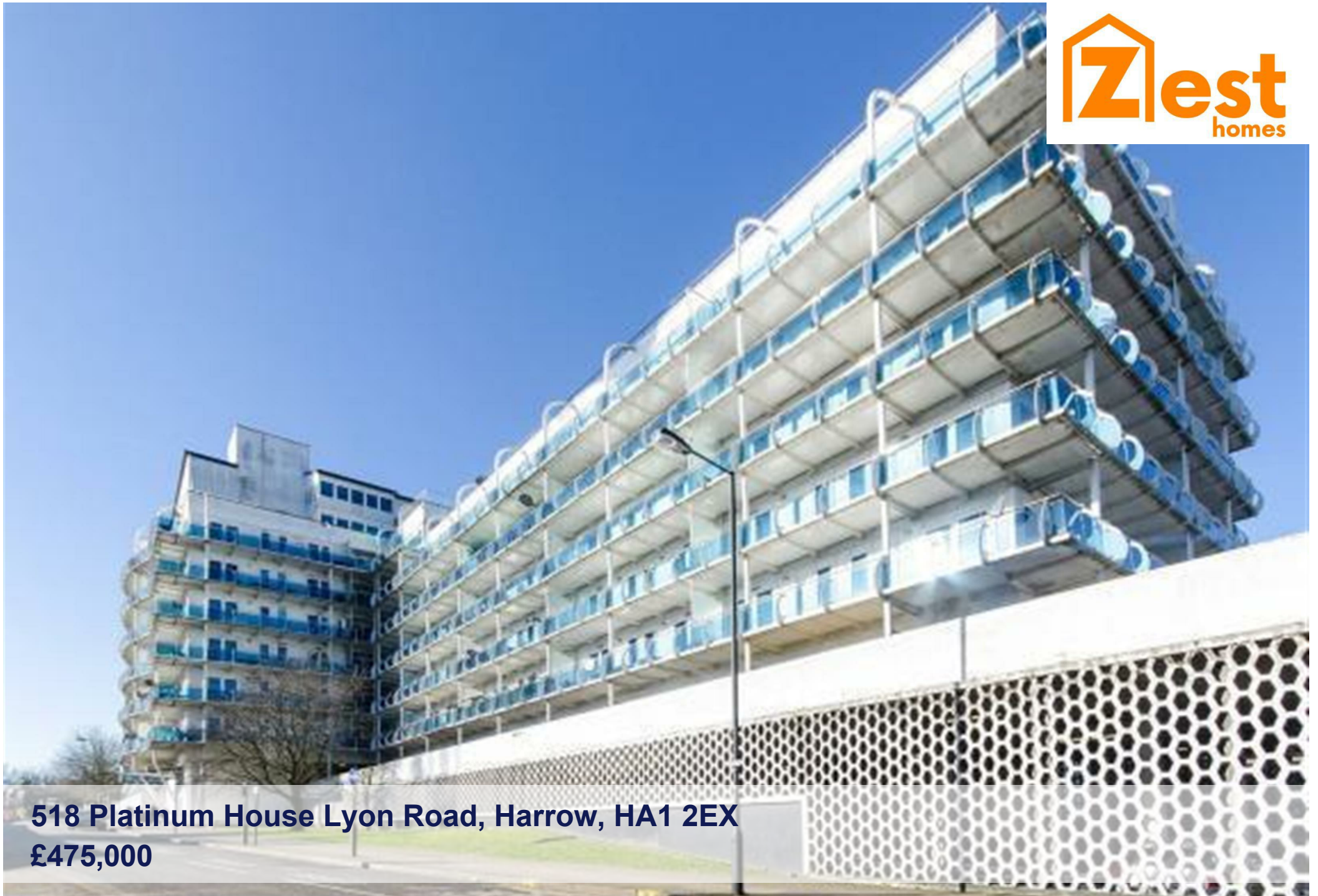
518 Platinum House Lyon Road, Harrow, HA1 2EX £475,000