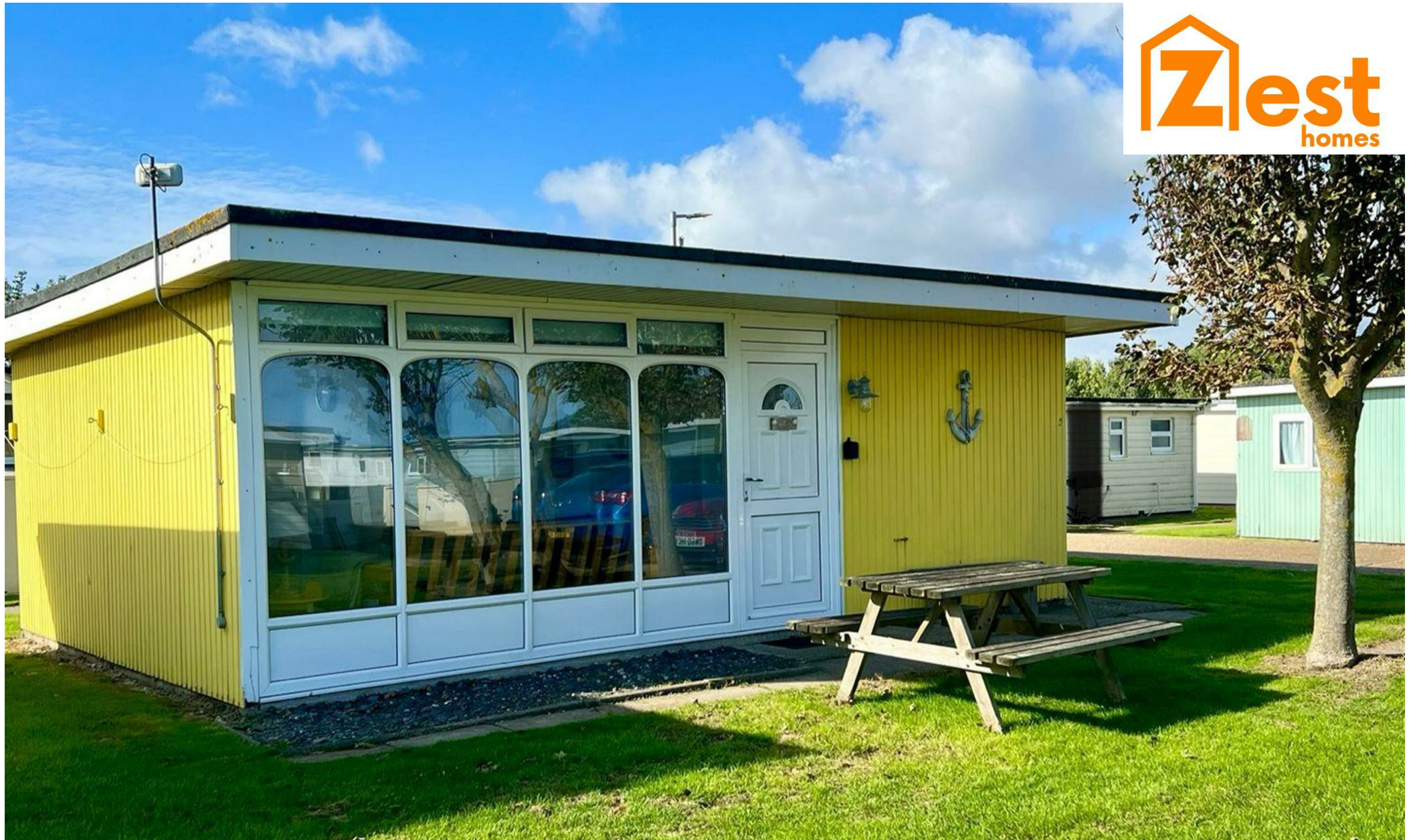
K139, Camber Sands Holiday Park New Lydd Road, Rye, TN31 7RT £48,000