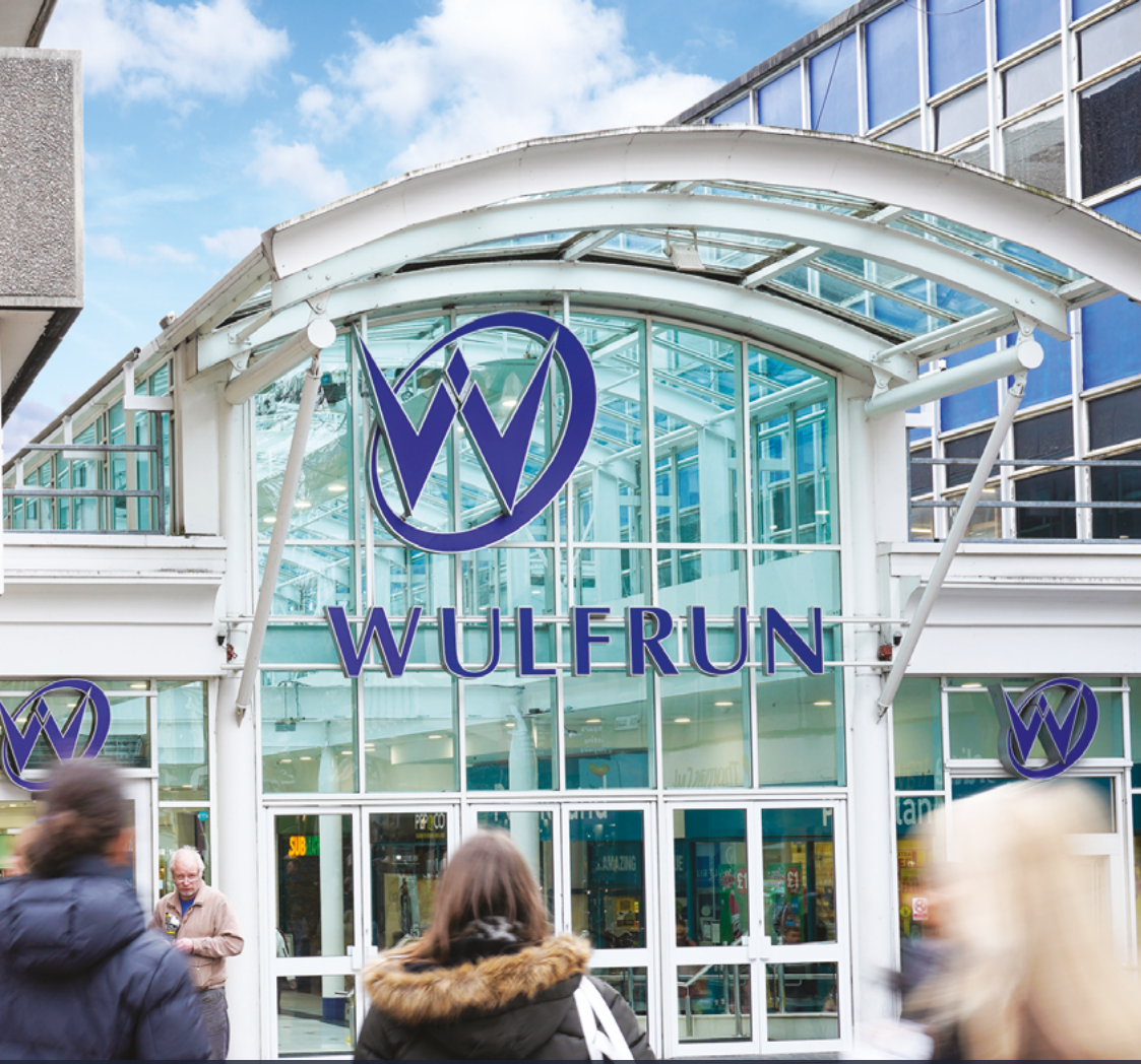
Wulfrun Shopping Centre, Wolverhampton, West Midlands WV1 3HH