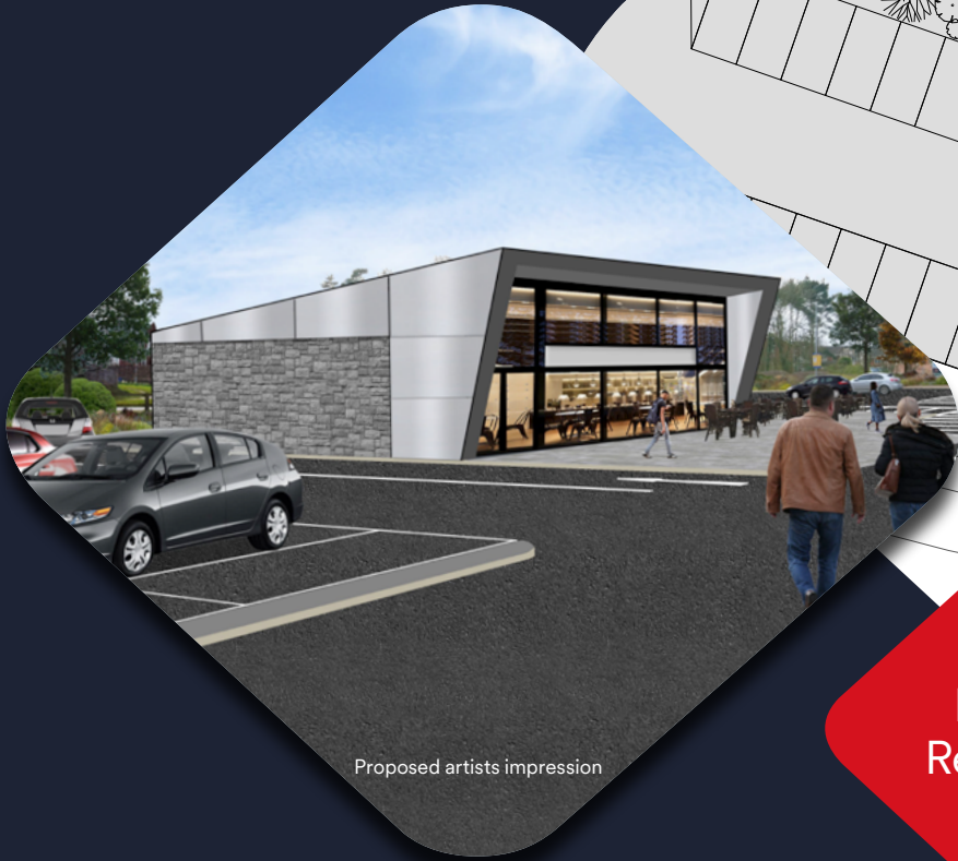
Proposed artists impression

0.3-acre site with potential for Drive Thru use