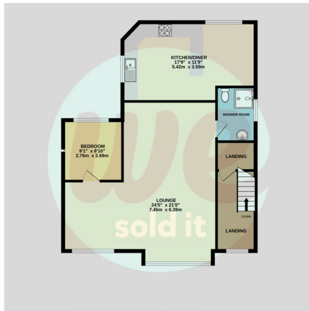
1ST FLOOR 866 sq.ft. (80.5 sq.m.) approx.