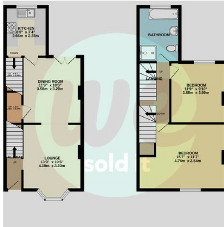
1ST FLOOR 414 sq.ft. (38.5 sq.m.) approx.